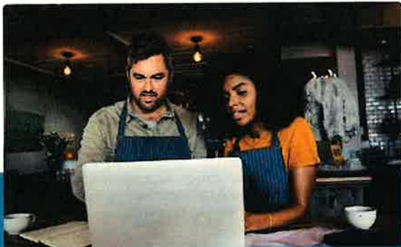
1799458426 1 10 24 ©2014 Copyright. All rights reserved. Windstream, Inc.

Windstream provides online billing at mybusiness.gokinetic.com